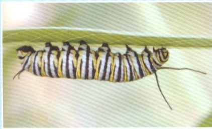
Left. Monarch caterpillar