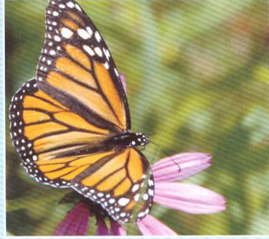
Above. Monarch butterfly